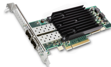
A new class of Smart NIC with the FPGA-like ability to inspect packets and shape traffic at line speed